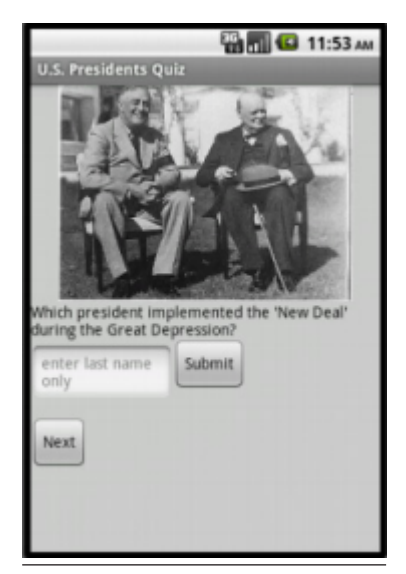
Figure 8-2. The Presidents Quiz in action