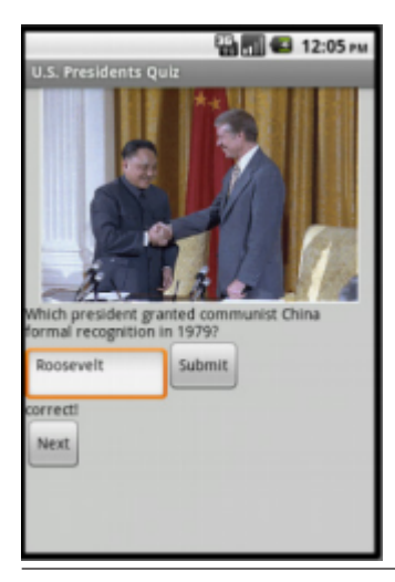
Figure 8-14. The quiz in action with the previous answer appearing when it shouldn't

Figure 8-13, even though you're looking at the next question. It's fairly innocuous, but your app users will definitely notice such user interface issues. To blank out the RightWrongLabel and the AnswerText, you'll put the blocks listed in Table 8-9 within the NextButton. Click event handler.